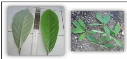
Figure 1. Actinodaphne glomerata (Medang paya)

The samples were air-dried at room temperature, somewhere ground to make powder. Dry powdered about 430.04 g of the sample was extracted using n -hexane at room temperature for 24 hours, then filtered the using filter paper. The filtrates were evaporated using rotary evaporator with the water bath set at 39 – 40 °C.