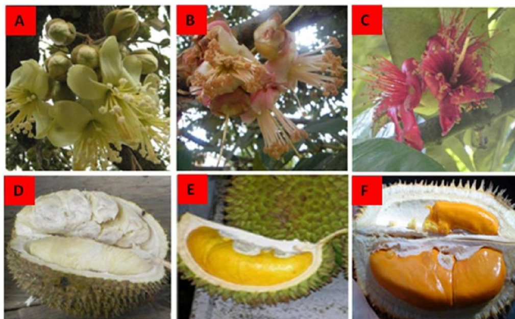
Fig. 2 Flower and fruit aril of Durio from East Kalimantan. A, D: D. zibethinus , B, E: Lai Durian , and C, F: D. kutejensis .

Durian (Table 2). This is consistent with the previous result that D. zibethinus had higher sugar content. During fruit ripening process, carbohydrates and other organic compounds will be degraded, in glycolysis metabolism, into simple compounds like sugars as a major product (Ahmed and Labavitch, 1980; Carrari and Fernie, 2006; Martinelli et al. , 2012). The higher the carbohydrate and lipid content the higher the sugar content will be produced. The content of carbohydrates and lipid of Lai Durian was higher than that of D. kutejensis , therefore Lai Durian was sweeter than the D. kutejensis .