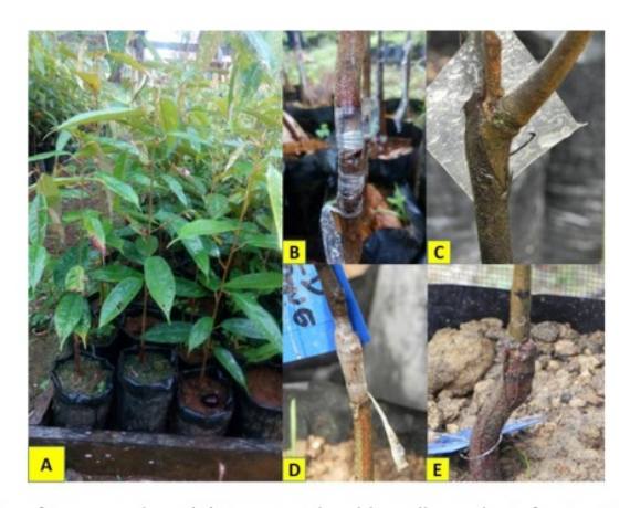
Fig 2. Chip budding and cleft grafting procedure. (A) Four-months-old-seedlings plants for Rootstocks; (B) Chip budding graft made by inserting a bud chip to a transverse cut up in a rootstock stem; (C) Graft union occurring at chip budding system; (D) Cleft graft made by inserting a scion shoot to a longitudinal cut to form a V shape; (E) Graft union occurring at cleft grafting system.