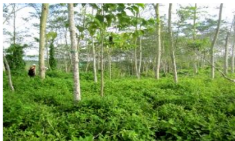
Figure 3 Rehabilitated land after land preparation

The spacious furnished area was close to the range between 80-89% of the work plan that has been previously set up (Figure 3). The result of land preparation was found that the realization of the land preparation reached at least 80% of planned areas, indicating that the landscaping allows the continuation of land revegetation works.