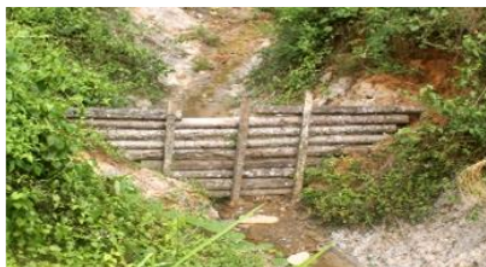
Figure 5 Overland flow control using retarding wooden construction

The number of soil conservation infrastructures was considered available enough (Figure 5) on the rehabilitated forest land of 24.47 ha (70-79%) in large. There was also wooden construction of soil conservation infrastructure in the form of a wooden check dam as much as of 2 (two) units (range 80-89%) on a reclaimed land area of 1.72 ha (OPDb-M2).