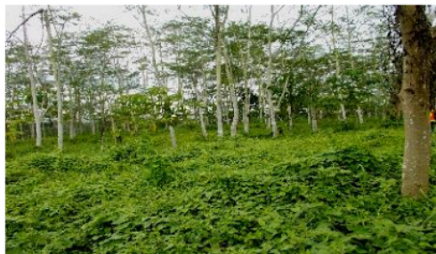
Figure 6 Land cover crops after four years of revegetation works

Cover crops planting was ranging 80-89%, covering 11.36 Ha. Cover crops in the early stage of Revegetation are vital to reduce excessive soil erosion and overland flow [2]. It is also expected to increase the organic materials supply into the soil to improve plant nutrients' availability. The condition of planting crops at OPD-Komodo: 5.39 ha/2010) KO-Komodo (2.24 ha/2010) OPDa M2 (8.54 ha/2011) as shown in Figure 6.