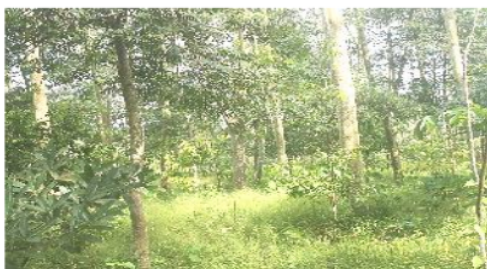
Figure 7 Mixed of fast-growing and long life species after four years

Realization of planting works was >90% of 21.65 ha area in large, and there was a ranging of 80-89% in the area of 2.82 ha. Concerning the land surface coverage, as much as 80% is considered an initial condition to support the recovery process of ecosystem structure and function of post-mining rehabilitated forest lands [5,9,11]. The more land surface coverage will invite various wildlife for living and regeneration within rehabilitated forest lands after coal mining operation [3,7] (Figure7).