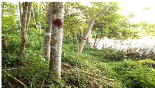
Figure 4 Slope stability at post-mining forest lands

Landslide movements were not found and therefore is assessed as very light (<5%) in an area of 6.21 ha, slightly landslide (5-10%) in 10.63 ha, heavy landslide (15-20%) in 2.24 ha, as well as a very heavy landslide (>20%) in 5.39 ha (Figure 4). These facts should be used for similar works in other locations related to slope stability to prevent the occurrence of landslide movements [31].