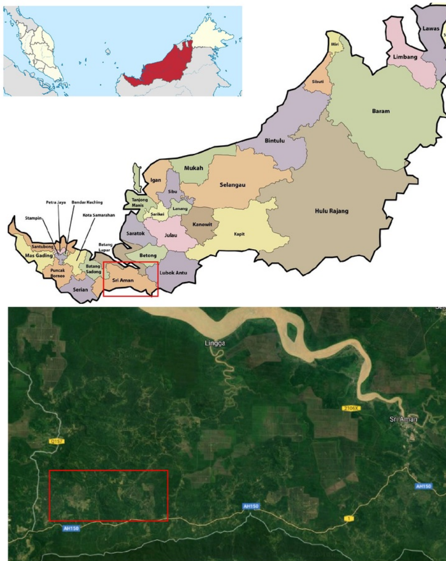
Figure 1. Map of the study area in Sabal, Sri Aman, Sarawak, East Malaysia

The surveys of vegetation were conducted in 5, 10, and 20 year old secondary forests. Twenty five sub plots each measuring 60 m × 20 m were established within each study site. The diameter at breast height (DBH) and total height of all woody trees with DBH of ≥ 5 cm within the plots were enumerated and their species were identified. Nomenclature was checked in the flora records of the study area (Anderson 1980; Jawa and Chai 2007).