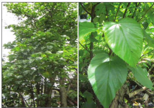
Fig. 1: Plant Melochia umbellata (Houtt) Stapf var. degrabrata K