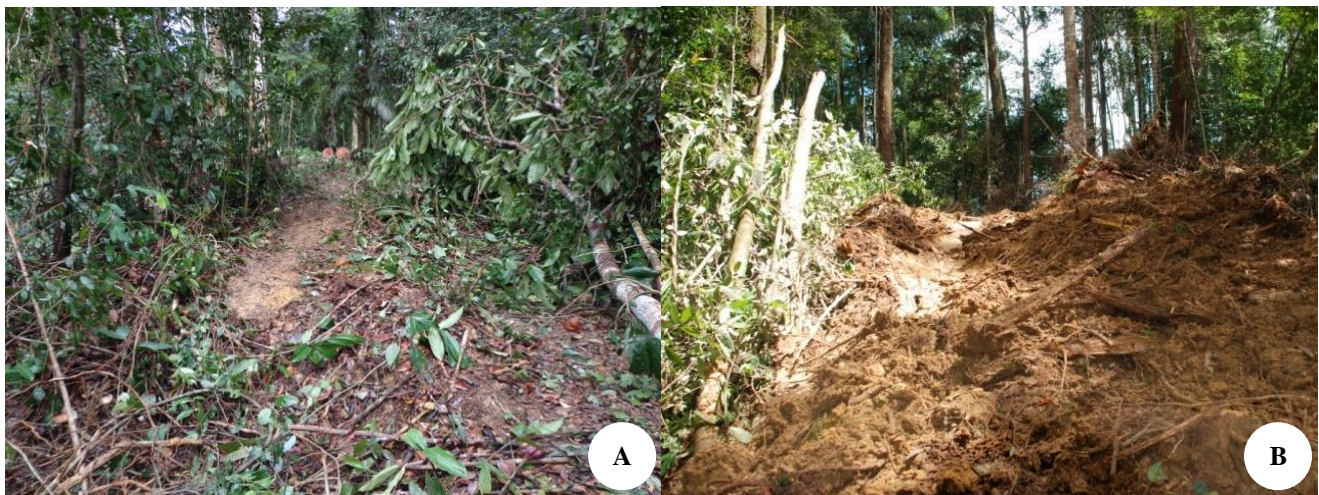
Figure 2. A. The view of stand and soil damage after skidding with mono-cable winch, and B. with bulldozer