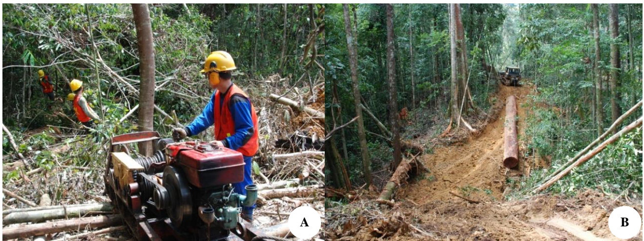
Figure 3. A. Small destruction towards forest floor induced by logs skidding as top soil with mono-cable winch, and B. very high destruction with bulldozer

This was backed up by previous research (Ruslim 2011), where, when viewed from the environmental, economic, engineering and even social aspects, the use of the mono-cable winch is an alternative that can be employed in the removal operation and is eligible to be used by the work area of forest timber products utilization business licensed concession holder (Table 3). Putz et al (2000) state lack of governmental incentives to change logging practices for not adopting RIL methods in the field.