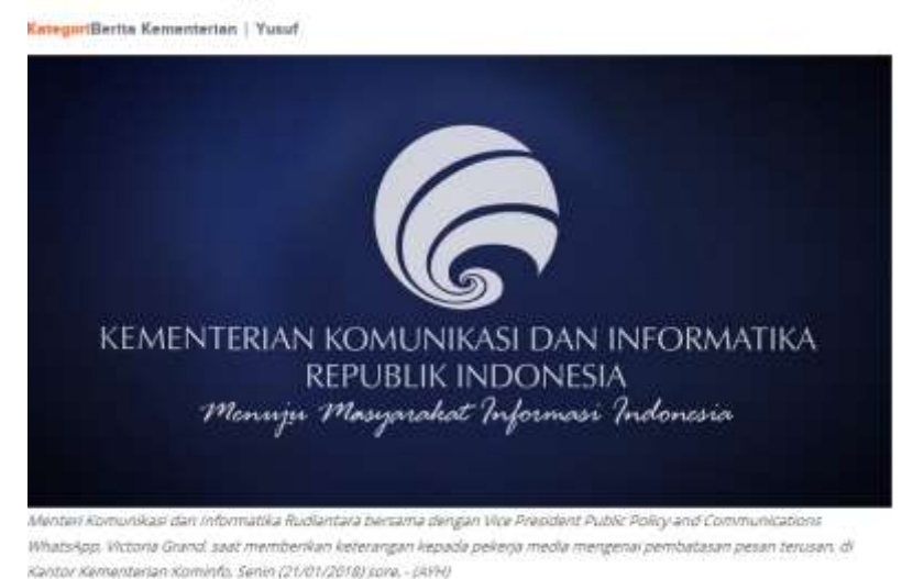
Source: Communication and Information Website Figure 2. Website of Communication and Information Website Before Announcement of Elected President 2019

The Ministry of Communication and Information explained that there are 800 thousand sites in Indonesia indicated as disseminators of hoaxes and hate (Pratama, 2016)