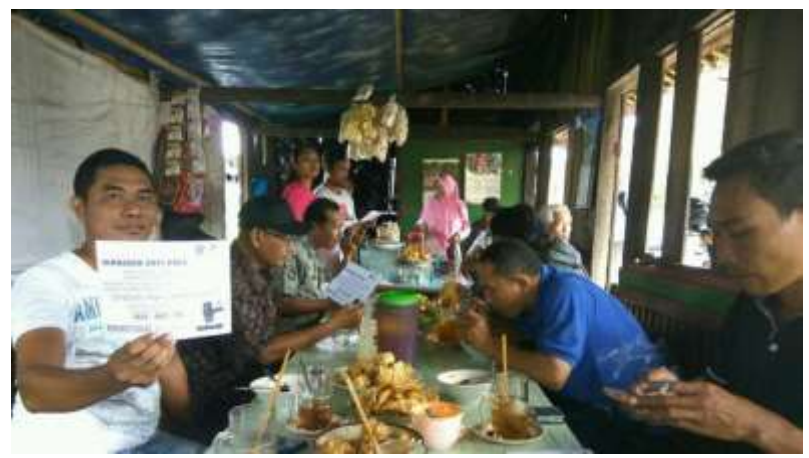
Figure 1. Anti Hoax pamphlet distributed to the public

However, many Millenials are not yet aware of the opportunities for technological advancement. Some are only consumptive consumers in social media, so they feel hedonistic and are unrealistic or even too idealistic. Some education and knowledge about media literacy are needed appropriately. The Worlds Most Literate Nations (WMLN) research on 2016 world literacy rates placed Indonesia 60th out of 61 surveyed countries, where the final position was occupied by Botswana Africa (Koran Jakarta,2019). This fact shows that Indonesia has not been literate in responding to hoax news that circulates freely on social media.