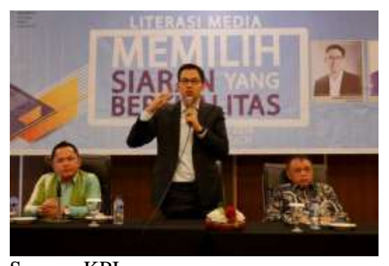
Figure 5. The Chairman of the Central KPI, Yuliandre Darwis, opened a media literacy in Padang

The picture above is the documentation of the Indonesian Broadcasting Commission in 2018 when conducting media literacy seminars in the city of Padang, one of 12 cities held in several Indonesian countries. This activity aims to encourage the public always to be critical in receiving information in various media. This activity invited academics, the community and literacy activists.