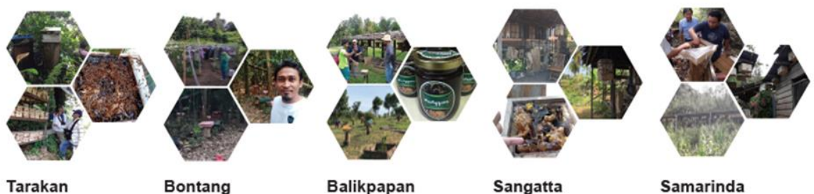
Figure 3. Meliponiculture in East and North Kalimantan.

Beekeeping and meliponiculture not only positively contribute to income gain, but also plays a role in increasing food security. Some communities in North and East Kalimantan already cultivate it with various methods, packing the honey, sell it to the local markets, and they also share their knowledges to other communities (Figure 3). However, beekeeping activity and its potential receive only subordinate attention within the Indonesian government and the public. According to scientists from Padjadjaran University (Dr. Mahani SP., M.Si., UNPAD, Bandung, Indonesia), bee businesses are mostly considered as a part-time farming activity. Not only parts of the local community, but also