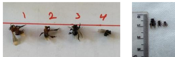
Figure 2. Species and sizes of Kelulut (stingless bees); 1. Homotrigona fimbriata ; 2. Geniotrigona thoracica ; 3. Heterotrigona itama ; 4. Tetragonula laeviceps .

Stingless bees have populated Earth's tropical regions for over 65 million years, which is longer than Apis spp. (the stinging honey bees) have existed [2]. Both honey bees and stingless bees make honey in perennial nests founded by a swarm of sterile female workers and a queen. Colonies maintain workers at all times and also males during certain times of the year. However, stingless bees are 50 times more diverse than the honey bees and differ from them in many biologically significant ways [8]. Within the Family Apidae, stingless bees belong to the Tribe Meliponini. Considered eusocial non- Apis bees, meliponines have extremely diverse morphology, nest building (nidification) habits, behavior, and ecology. They are small to medium-sized bees (2–13 mm in length) (Figure 2) with considerable variation in colony population size (from several hundred up to more than 10,000 workers per colony). They also exhibit a high rate of brood production and require substantial pollen intake [8].