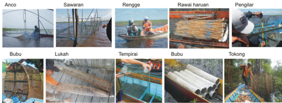
Fig. 2. Local fishing gears used for fish collection in the study locations in the middle Mahakam, Kutai Kartanegara district