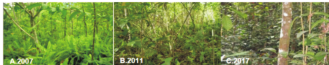
Fig. 4. View of vegetation growth at rehabilitated mined-out forest lands: A. 2007, B. 2011, C. 2017 (Upper Nakan Plot-138)