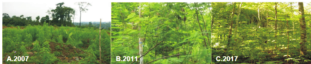
Fig. 3. View of vegetation growth: A. 2007, B. 2011, C. 2017 (Lower Nakan Plot 164)

Conservation biology is the management of nature and of earth's biodiversity with the aim of protecting species, their habitats, and ecosystems from excessive rates of extinction and the erosion of biotic interactions. Therefore, conservation biology addresses the dynamics and problems of perturbed species communities, and ecosystem (Lei et al. , 2015). Forest fragments exhibit striking changes in the vicinity of their borders, known as edge effects (Laurance, 1997; Laurila-Panta et al. , 2015). These effects are driven by microclimatic changes which occur in forest edges (Pinto et al. , 2010). Microclimatic changes in turn cause a general increase in mortality of plant communities as well as increased turnover and growth (Laurance et al. , 2002). Empiri-