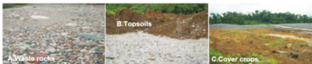
Fig. 2. Initial condition of minedout forest land : A. land preparation layered waste rocks, B. Topsoils spreading, and C. Planting cover crops (2006)

Upper Nakan (Plot-138) is characterised by big size rocks over layered with topsoils spreading and tree planting in 2007. Octomeles sumatrana decreased in number. Similar case occurs of Macaranga hypoleuca which is dying due to wild plants e.g. Ipomoea sp and Meremia sp . Wild plants were Calliandra calothyrsus , Melastoma polyanthum , Trema canabina Lour., Widelia trilobata , Piper aduncum L., Musa sp. , Hibiscus tiliaceus , Mimosa pudica , Nauclea subdita , Sesbania grandiflora Poir., Passiflora foetida , Trema