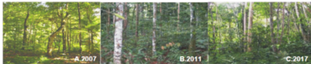
Fig. 6. View of vegetation development at rehabilitated mined-out forest lands: A. 2007, B. 2011, C. 2017 (Lingau Plateau)

cal studies shows that changes in composition are related to their functional type, late-successional, shade-tolerant species showing abundance decline at forest edges, and early-successional, shade-intolerant species increased abundance (Oliveira et al. , 2008). Emergent trees are also vulnerable in small edge-effect dominated areas, and their loss contributes to a reduction biomass values (Dantas de Paula et al. , 2011).