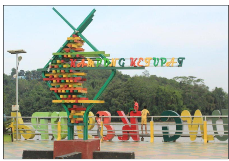
Fig. 3. Area of "Kampung Ketupat"

If this perception develops, they can find it out that parents will tend not to pay attention to their child's education. As a result, the aim of education to catch up with other nations will be difficult to achieve. They also hampered the motivation of children who will continue to various levels of study. In releasing fatigue after helping their parents to work, children prefer to play (see Figure 3 ).