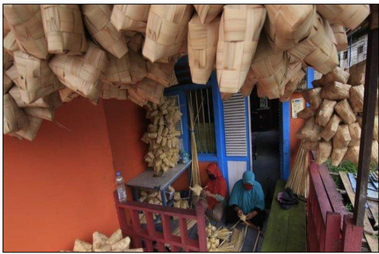
Fig. 2. Ketupat Craftsman Activities

Education is the effort to create human character, mind, and body in order to show the perfection of life in harmony with nature and society and to achieve the highest happiness. Community participation in "Kampung Ketupat" in the education of children aged 6—18 years is still very low. They still think it is better for children to help their parents earn a living or to help work in the fields. The parties most responsible for children's education are parents because they are the primary educators by nature. Here, the factors associated with the level of education of the socioeconomic status of the parents.