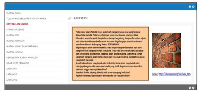
Figure 3. Example display sub material pages are presented in the form of text, tables, and figures.

The third to tenth menu contain sub-material Chemical Bonding, consisting of 8 sub-materials: (1) Stability of elements; (2) Lewis structures; (3) Ionic bonds; (4) Covalent bonds; (5) Coordination covalent bonds; (6) Metal bonds; (7) The polarity of covalent bonds; and (8) The properties of compounds. Presentation of sub-material in the EXE Learning media was carried out in various forms: the form of text/narration, animation, video, and images. The presentation of material in the form of videos, animations and pictures is intended to increase the conceptual understanding in chemistry (Adhi & Linuwih, 2018; Pekdag, 2010), because the use of various modes of representation can connect the three levels of chemical representation: macroscopic, submicroscopic, and symbolic (Farida et al., 2018). One example of display sub-menu material in text form can be seen in Figure 3.