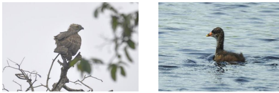
Figure 3. Ichtyophaga humilis (The Lesser Fish Eagle) and Gallinula tenebrosa (The dusky moorhen)

Some of the protected bird species and their pictures are shown in the following figure.