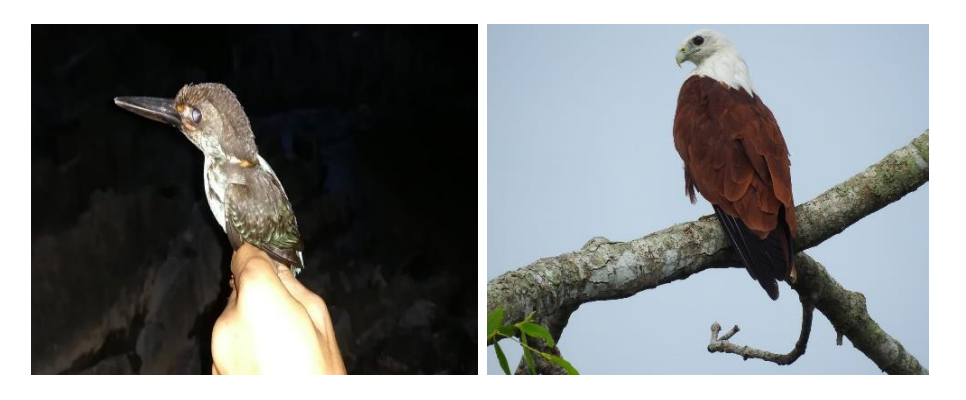
Figure 6. Alcedo euryzona and Haluartur Indus

Gallinula tenebrosa is an endemic species of Kalimantan that has not been seen in over a century (Mac Kinnon 2010). However, it is widely distributed throughout the world, including Australia and the United States. Ichtyophaga humilis is also a species that is rarely found in many bird surveys throughout East Kalimantan. This is most likely due to its special diet, which is commonly found in wetlands. The Sumatra bar-bellied cuckoo shrike is also uncommon in many surveys because it prefers to perch on tall trees.