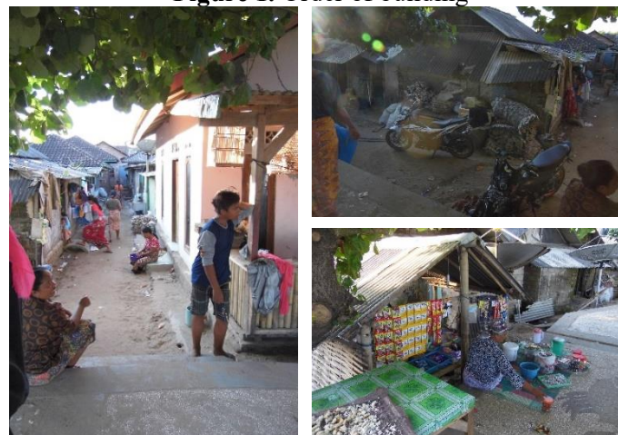
Figure 2. House building and waste conditions