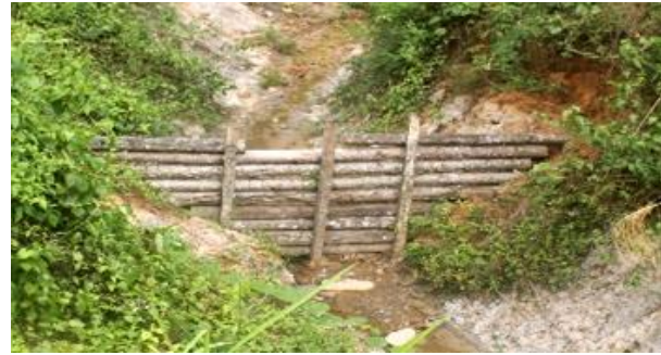
Figure 5 Overland flow control using retarding wooden construction

The number of soil conservation infrastructures was considered available enough (Figure 5) on the rehabilitated forest land of 24.47 ha (70-79%) in large. There was also wooden construction of soil conservation infrastructure in the form of a wooden check dam as much as of 2 (two) units (range 80-89%) on a reclaimed land area of 1.72 ha (OPDb-M2).