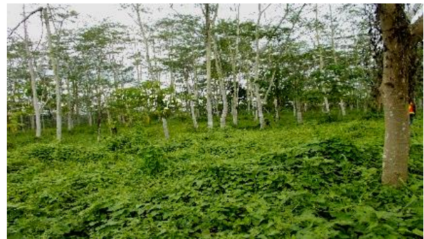
Figure 6 Land cover crops after four years of revegetation works

Cover crops planting was ranging 80-89%, covering 11.36 Ha. Cover crops in the early stage of Revegetation are vital to reduce excessive soil erosion and overland flow [2]. It is also expected to increase the organic materials supply into the soil to improve plant nutrients' availability. The condition of planting crops at OPD-Komodo: 5.39 ha/2010) KO-Komodo (2.24 ha/2010) OPDa M2 (8.54 ha/2011) as shown in Figure 6.