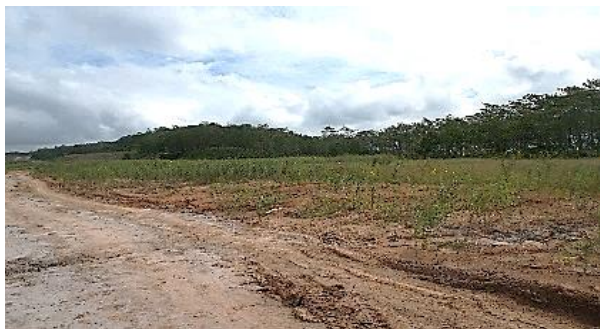
Figure 2 Land preparation at Ex-Pit IPDa-Komodo 2010 (5,11 Ha)

Backfilling work was done at IPDa-Komodo with close to >90% (Figure 2) from the plan previously set up in the area of 5.11 ha. This work is vital in achieving safe and enabling landscaping phases of mined-out forest land for complete land rehabilitation works and ecosystem recovery [14].