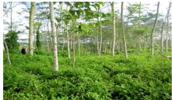
Figure 3 Rehabilitated land after land preparation

The spacious furnished area was close to the range between 80-89% of the work plan that has been previously set up (Figure 3). The result of land preparation was found that the realization of the land preparation reached at least 80% of planned areas, indicating that the landscaping allows the continuation of land revegetation works.