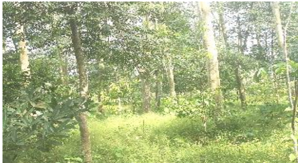
Figure 7 Mixed of fast-growing and long life species after four years

Realization of planting works was >90% of 21.65 ha area in large, and there was a ranging of 80-89% in the area of 2.82 ha. Concerning the land surface coverage, as much as 80% is considered an initial condition to support the recovery process of ecosystem structure and function of post-mining rehabilitated forest lands [5,9,11]. The more land surface coverage will invite various wildlife for living and regeneration within rehabilitated forest lands after coal mining operation [3,7] (Figure7).