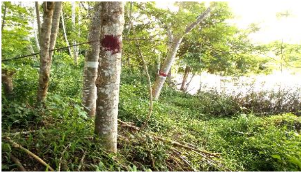
Figure 4 Slope stability at post-mining forest lands

Landslide movements were not found and therefore is assessed as very light (<5%) in an area of 6.21 ha, slightly landslide (5-10%) in 10.63 ha, heavy landslide (15-20%) in 2.24 ha, as well as a very heavy landslide (>20%) in 5.39 ha (Figure 4). These facts should be used for similar works in other locations related to slope stability to prevent the occurrence of landslide movements [31].