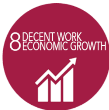
Figure 2. Pillar 8 in SDGs