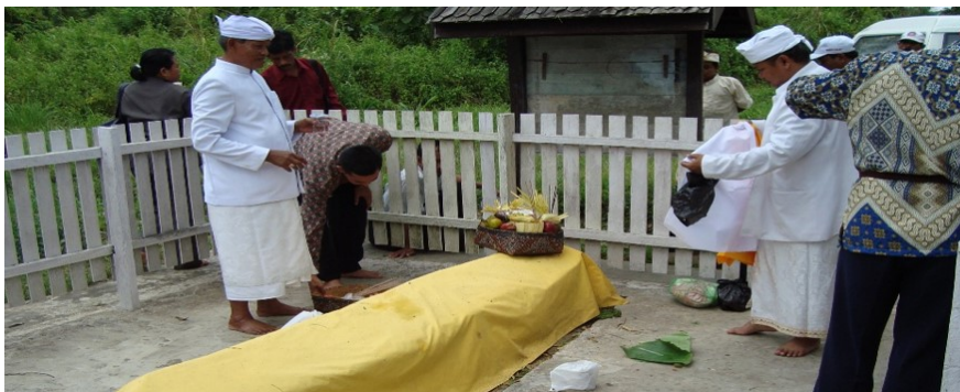
Figure 2. Kutai Yupa ceremony

According to Ardita 34 , a Kutai chief asked to build a place of worship for maintaining harmony and the “security” of the surrounding areas. When Hindu communities carried out ceremonies therein, some local people in the surroundings asked for the edible offerings as blessings from those in “sacred” power. This site then became cultural heritage ( cagar budaya ) managed by the Kutai Kartanegara district government.