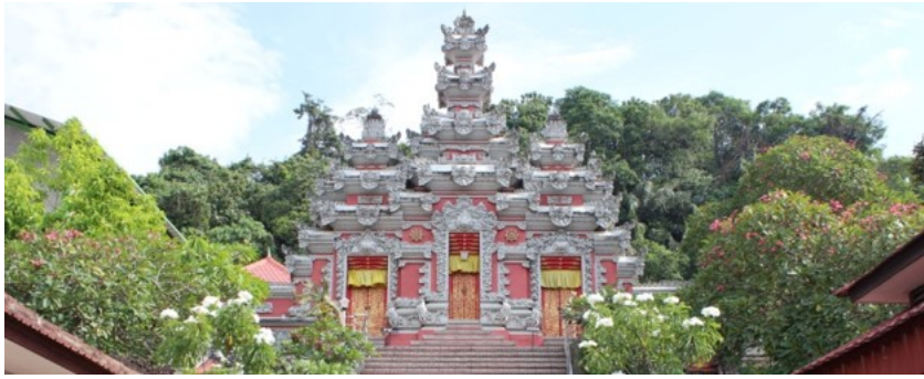
Figure 4. Ornate Samarinda Hindu Temple

In addition, a Bali dress code for men (white udeng headgear, shirt, and white fabric covering colourful Balinese sarong ), and for women (white traditional kebaya ) had been imposed for praying. Our Balinese diaspora is definitely friendly and welcoming to all Hindu friends from other ethnic and denominational backgrounds; so in the Balinese view it is not exclusive, but from the other community's perspective the Balinese are indeed being exclusive by having created participatory boundaries. Thus the Tolotang, feeling “out of place”, are reluctant to pray at the temple, as the elaborateness and dress code hampers their engaging in further socio-religious interaction, similarly affecting Toraja/Mamasa Hindus, Dayak Kaharingan Hindus and to some extent Dayak Paser Hindus in East Kalimantan. The authors call this as “quasi-exclusiveness”.