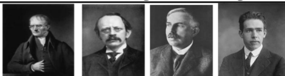
(a) J. Dalton (b) JJ Thomson (c) E. Rutherford (d) Neils Bohr Figure 2. Inventor of Atomic Theory

Students with auditory learning styles have learning styles that are dominated by hearing. At the first meeting, the auditory students had an average score of 70 which was categorized as sufficient (Table 2). The auditory student's post-test 1 score was the lowest compared to the scores of students whose learning styles were visual and kinesthetic. In the learning process, the teacher explains the material through audio scores directly so that auditory students can understand the material presented by the teacher. The teacher also delivers material by inviting students to discuss in the whatApps group class. Because auditory students tend to learn by listening some things can be an obstacle to why auditory students' scores are lower than visual and kinesthetic. Some of the obstacles are when studying, auditory students, their concentration is easily broken and easily disturbed by noise [10] - [12]. During the current pandemic, students learn from home. Without realizing it, family members were chatting not far from the students. For auditory students, this conversation interferes with their learning concentration. Besides, what hinders auditory student learning is the internet network that is not strong enough, causing the voice to sound intermittent, so it cannot be heard properly.