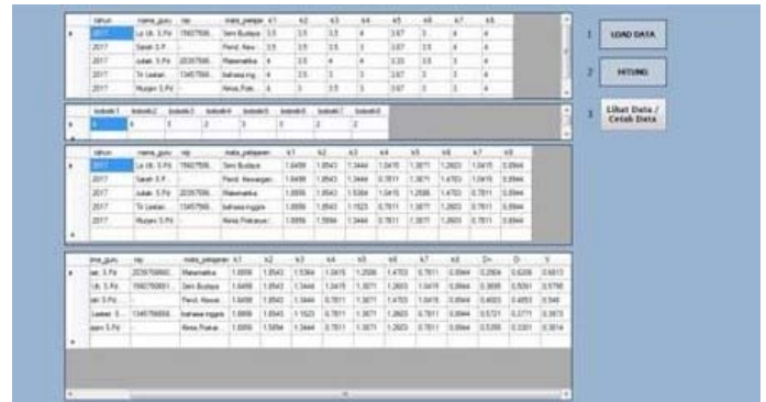
Figure 3. TOPSIS Calculation Form