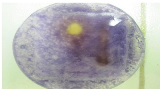
Figure 2. TLC result of D. dao stem bark extracts on MSSA with MTT

Note: colorless bands show secondary metabolites that inhibited the growth of MRSA; TLC = thin layer chromatography, MH = Mueller-Hinton, MTT = 3-(4,5-dimethylthiazole-2-yl)-2,5-diphenyltetrazolium bromide, MRSA = Methicillin-resistant Staphylococcus aureus