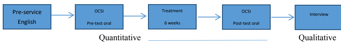
Figure 1. Research design

In this study, whether the oral communication strategies training had an effect on pre-service English teachers' speaking performance was investigated with the quantitative research design with a pretest-posttest model. While qualitative design was used to explore the pre-service English teachers' view on the implementation of oral communication strategies training. The type of mixed-method design that the researchers applied in this study is in the explanatory design. The quantitative and qualitative data were collected and analyzed in sequence: quantitative data was collected and analyzed first then followed by the qualitative data. The research design is shown symbolically in Figure 1.