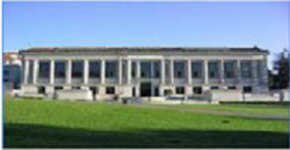
UC Berkeley Libraries, California, United States