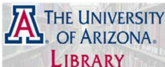
Tucson, Arizona, United States